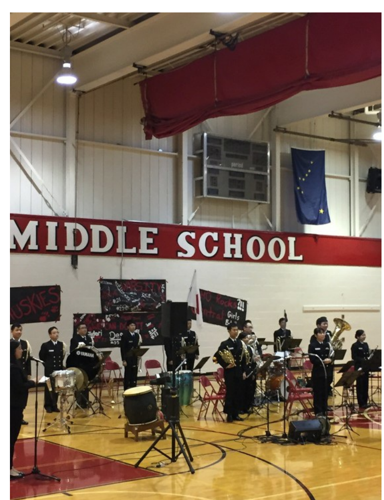
Japan Maritime Self Defense Force Training Squadron band performs for students at Central Middle School of Science