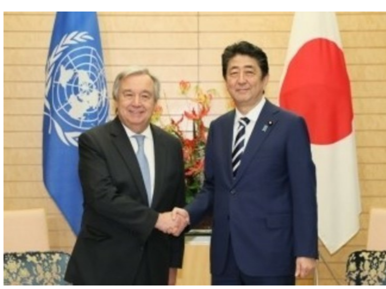
Prime Minister Abe with UN Secretary-General Guterres