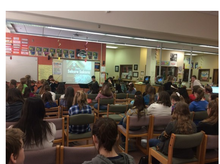
University of Alaska Anchorage String Ensemble performing Japanese music at Colony Middle School

In 2017, the Consular Office of Japan in Anchorage undertook multiple efforts to further strengthen Japan-Alaska relations. This year's highlights include: