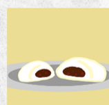
あんこもち Anko Mochi

協力: 在アンカレッジ領事事務所 / Supporter: Consular Office of Japan in Anchorage