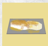
きなこもち Kinako mochi