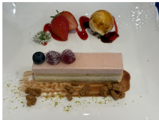
Meals at the seminar featuring Alaskan seafood and birch syrup