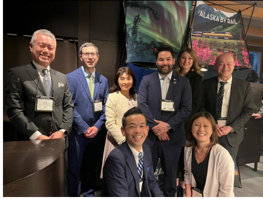
With tourism industry representatives at the Tokyo media dinner.