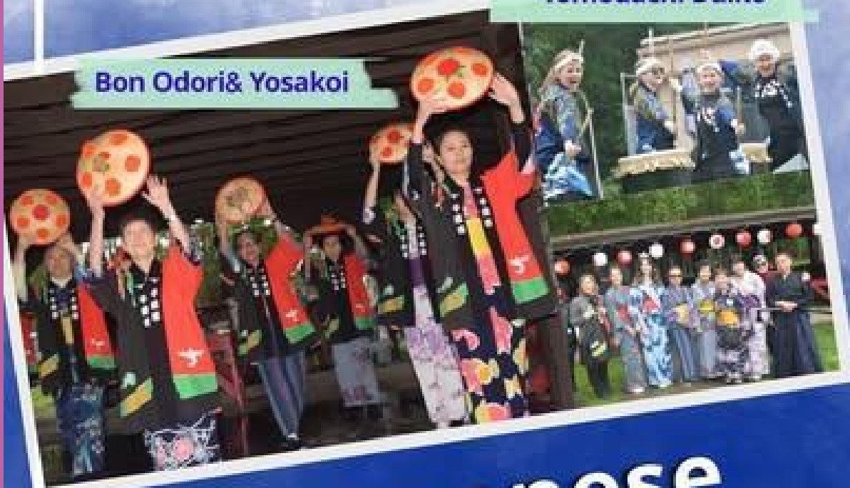
Bon Odori& Yosakoi