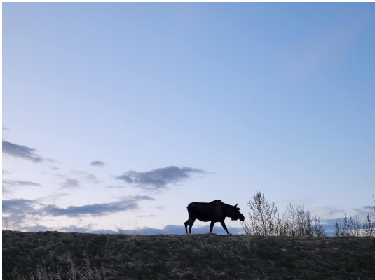
Still bright at 10:30 PM - summer in Anchorage

While Japan moves from rain to heat, Alaska enjoys endless sunlight and cool temperatures.